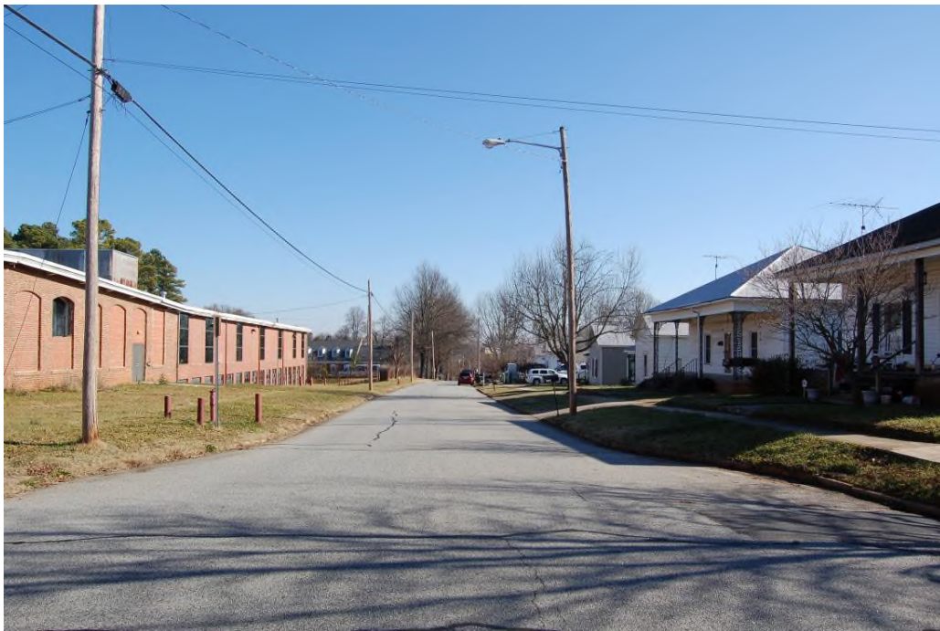
1000 Block of Mill Avenue, looking east

Photographs by Laura A. W. Phillips, October 2012