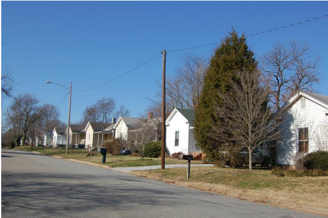
900 and 1000 Blocks of Proctor Drive, north side