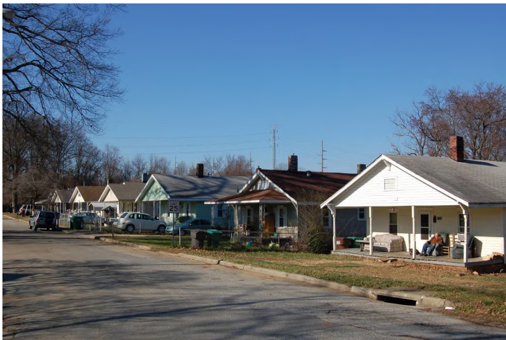
1100 block of Young Place, north side