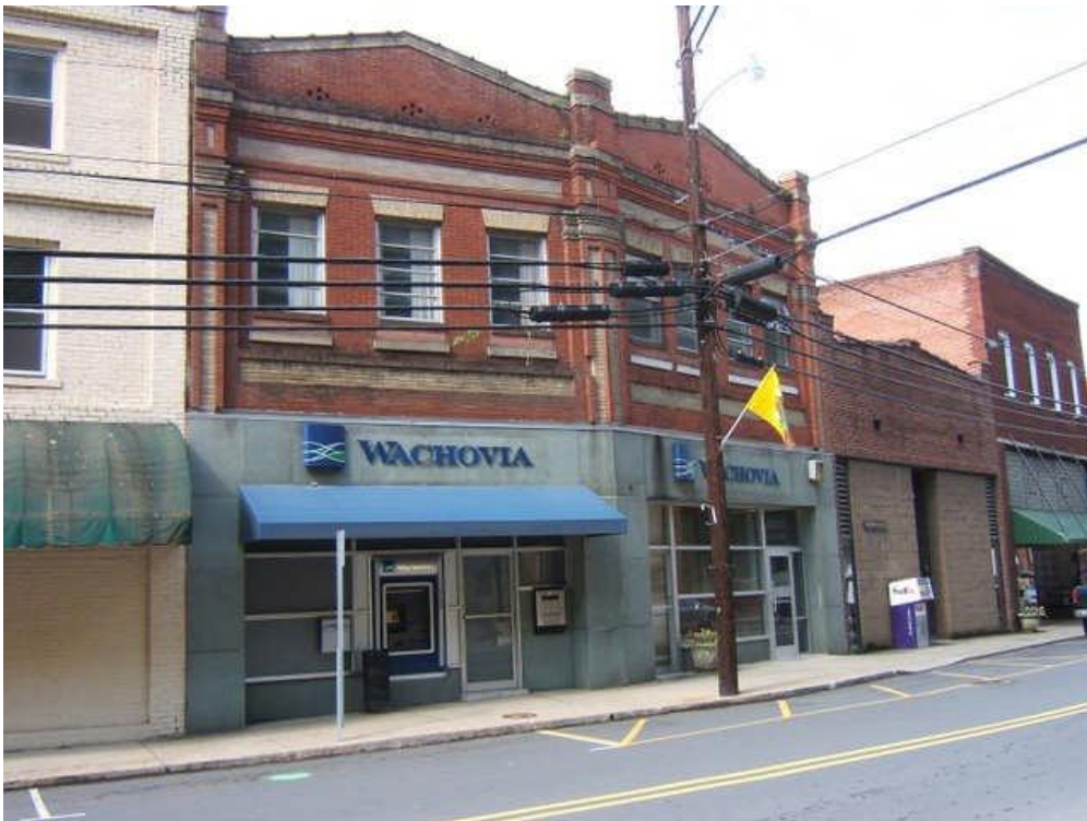
South side of Main Street

Marshall, Madison County, MD0056, Listed 8/16/2007 Nomination by Sybil Argintar Photographs by Sybil Argintar, July 2006