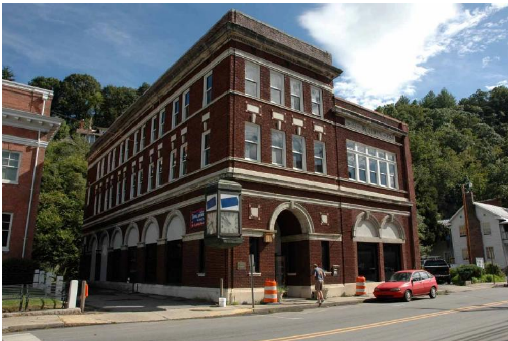
Bank of French Broad, 100 Main Street